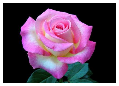
District Queen Cajun Sunrise

I have chosen not to run for another term as district director for personal reasons. We are actively searching for anyone who is interested in running for the term that begins in September 2012. Deadline for sending the paperwork ARS to headquarters is January 31, 2012. If you have an interest please call or email me with any questions you may have.