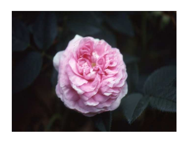
Konigin von Danemark