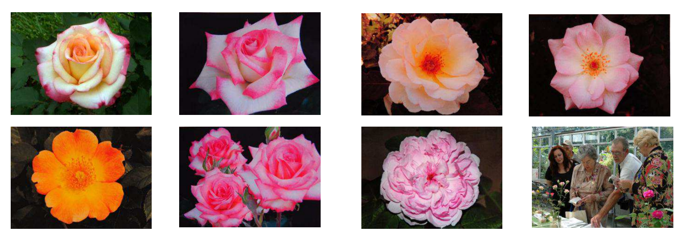
Top row: Class 1, Class 3, Class 4 and Class 5 winners Bottom row: Class 6, Class 7, Class 8 and Class 12 winners