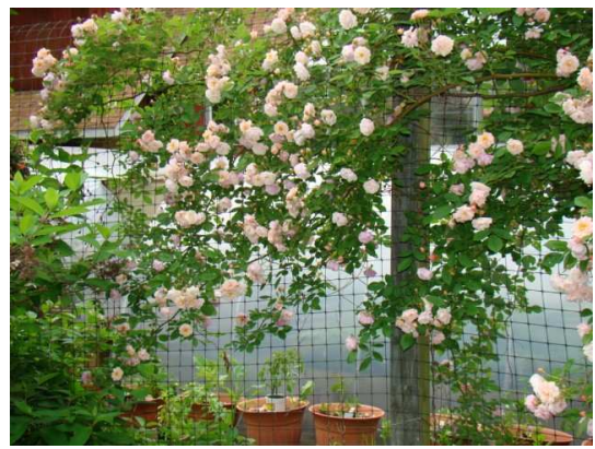
Pink climber in Michael Bowell's garden

The paths through the garden lead you pass pots overflowing with combinations of plants in differing color schemes and unusual garden statuary and art. Other paths lead you to gardens where roses are used as backgrounds for plant mixes. Roses tumble over fences that protect growing areas. Comfortable shoes are a must for this tour as you are in real Chester county country.