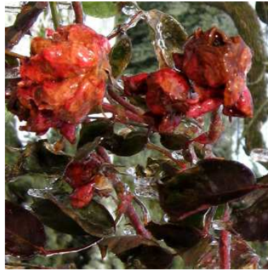
Iced Dublin Bay 12/20/08

Please note the early hotel reservation deadline for the Winter Rose Get-A-Way is January 13, 2009