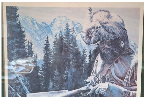
A Few More Photos from the Smith Collection

What Works - Lawrence (in-person) - Mid-America Arts Alliance