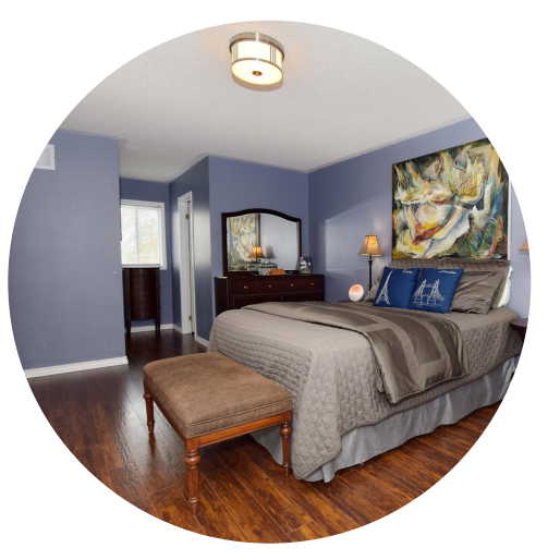
Large Master Bedroom Features a 4 Piece Ensuite with a Separate Shower and a Large Walk-In Closet. Two Additional 2nd Floor Bedrooms