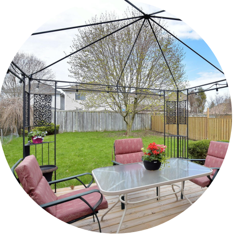
Pool Sized Back Yard with Newer Deck and Mature Trees.