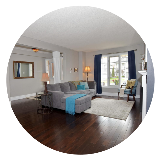
Large, Open Concept Great Room with Gas Fireplace and Hardwood Floors