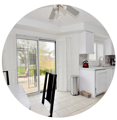
Upgraded Kitchen with Walk out to Large Deck and Yard