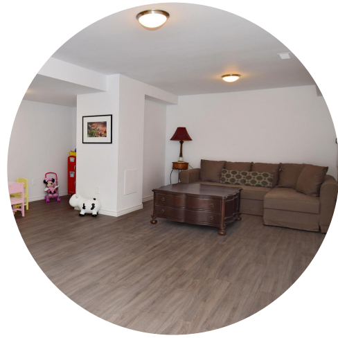
Beautifully Finished Basement with Recreation Room and Separate Office Space