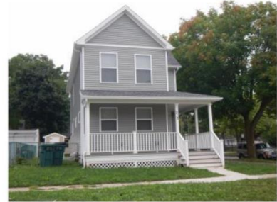
2016: 213 Orange Street