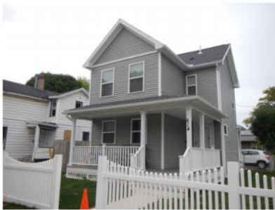
2017: 614 Jay Street