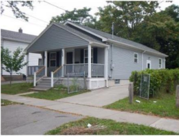
2011: 386 Campbell Street