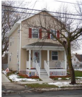
2018: 454 Child Street