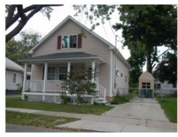
2013: 10 Kondolf Street