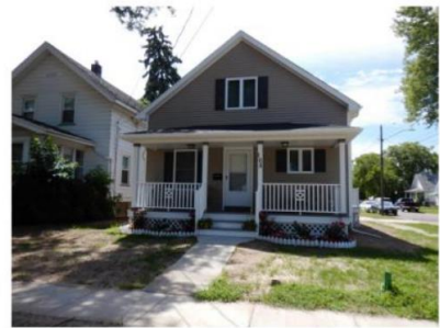
2019: 105 Holworthy Street