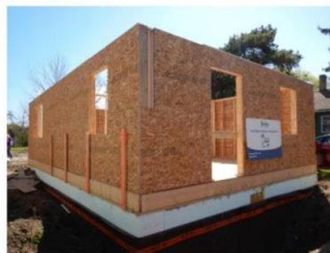
And, our current house for 2021 at 79 Lime Street