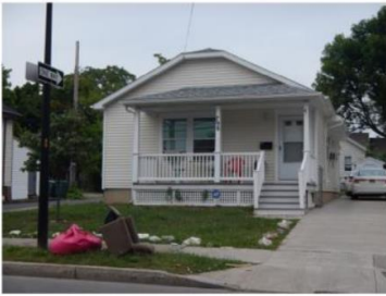
2014: 796 Jay Street