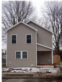
2020: 423 Jay Street