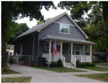
2015: 170 Orange Street