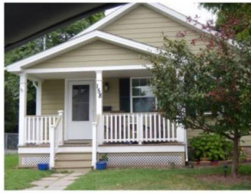
2012: 158 Campbell Street