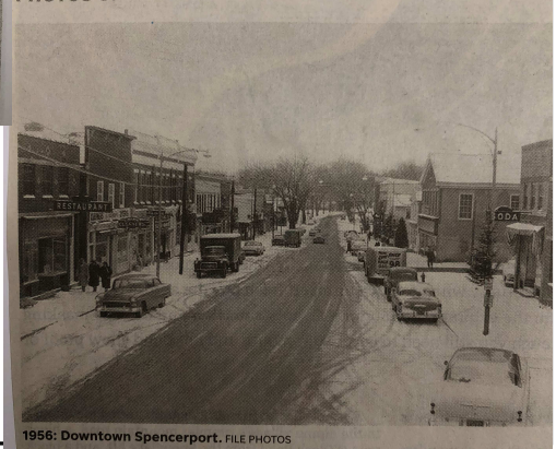
1956: Downtown Spencerport. FILE PHOTOS