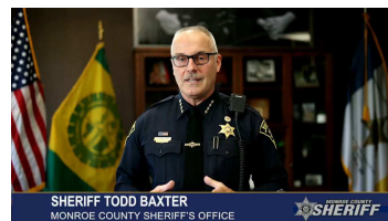
Todd Baxter, Monroe County Sheriff

Saturday—January 11, 2025 11:00 AM—Bethany Large Hall $7.00 p/person