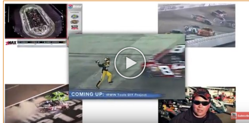
NASCAR Traveling Kiosk Kiosk Designer w/Content - Bristol