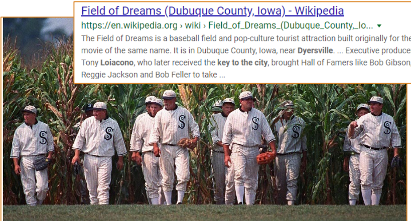
Loiacono Created and Produced Field of Dreams Events (2)