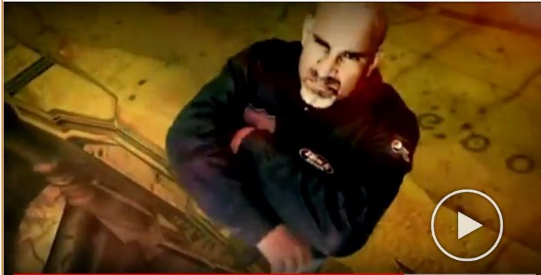
Goldberg TV Commercials - SPEED