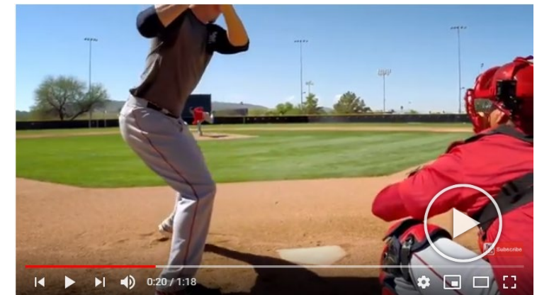
LIVE TV Production - Umpire Cam Technology developed by Loiacono