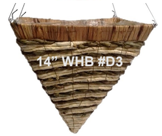
14" WHB #D3