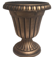
18" Fluted Urn