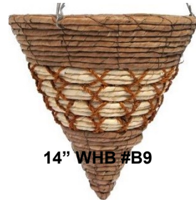
14" WHB #B9