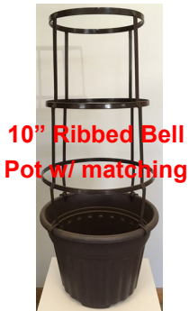
10" Ribbed Bell Pot w/ matching