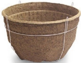
18" FIBERGROW BASKET W/ HANGER $62.95 FOR 6