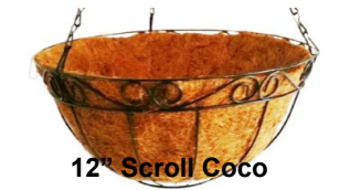
12" Scroll Coco