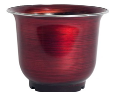
13 3/4" Amalfi Pot