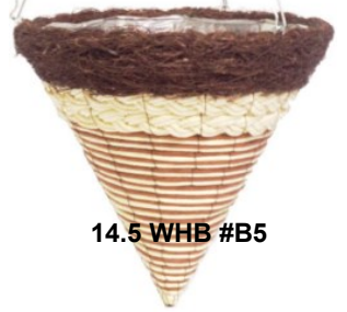
14.5 WHB #B5