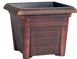
14" Katrina Square