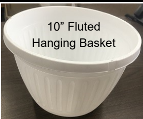
10" Fluted Hanging Basket

AL-PAR PEAT SPECIAL PRICING THROUGH DEC.