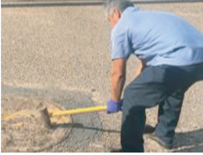
Sledgehammers - Unnecessary Reduce Damage & Injuries