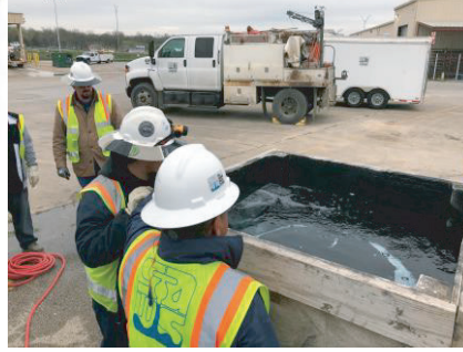
Validated. "Best By Far" Watertight - 0.0 GPM Submerged in 16"!