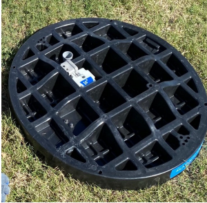
Signals pass through. No wire holes needed. No top surface antenna. Skip drilling. "Protect your tech."