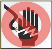
No Shocks & Burns