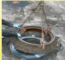
Fast, Cheap Install