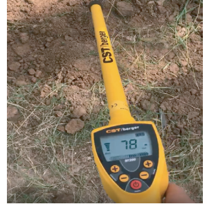
Encapsulated detectable technology...not attached metal. Unique to CAP.