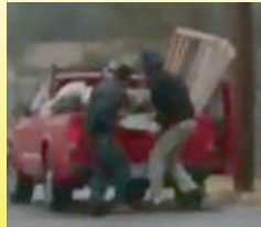
No Sellable Scrap