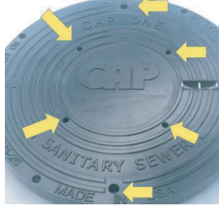
CAPs hold in odor, but we also have vented options. Locks are Xylan coated, 316 SS with bolt head options.