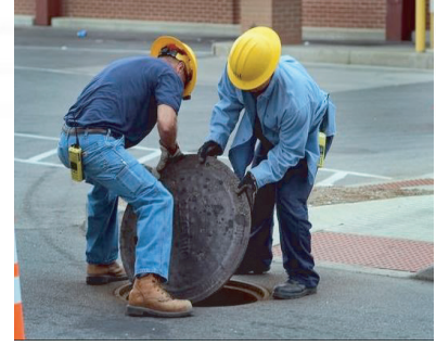
Less than half iron weight Safer for back, fingers, toes. But the heftiest composite