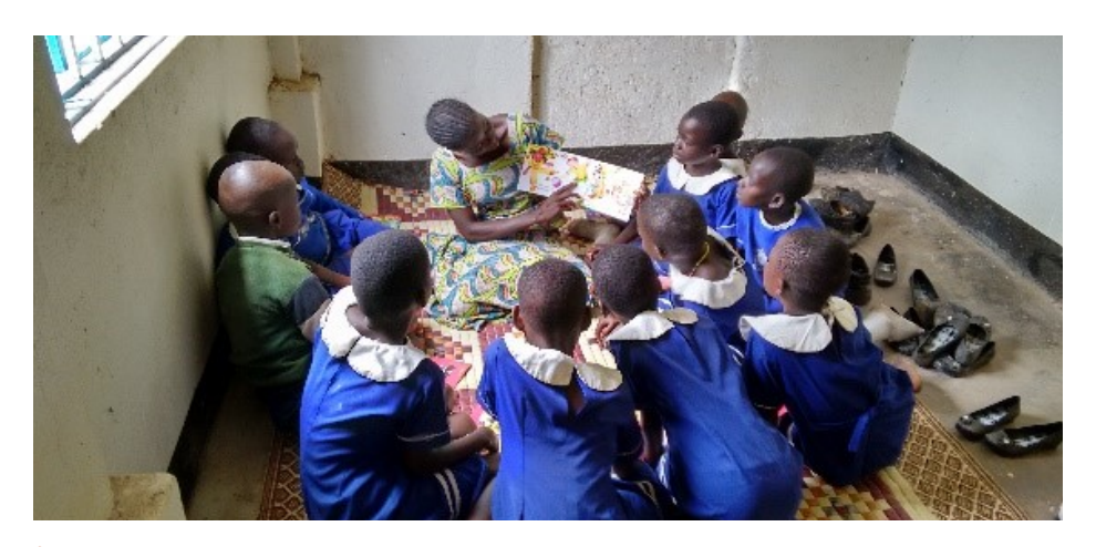
Students enjoying the library / Uganda