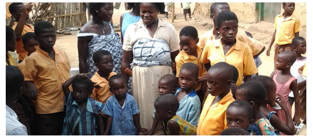
Children gather to obtain health insurance / Ghanc