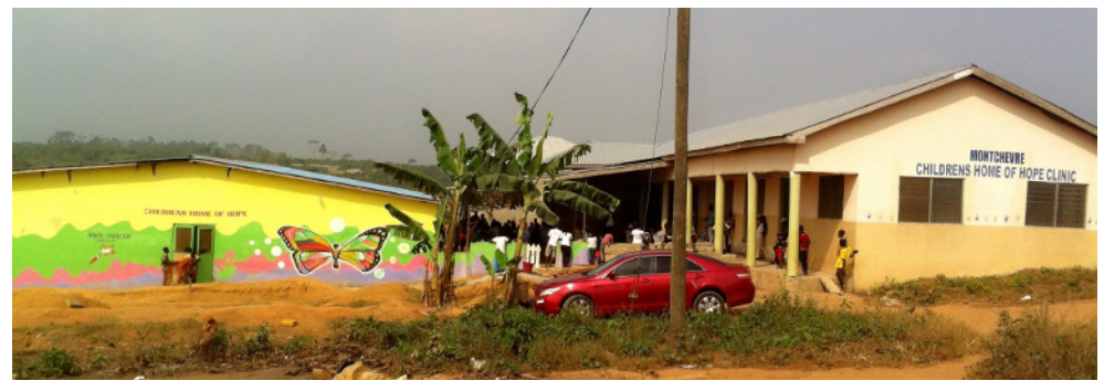
Home for Hope today plus clinic built by Montchevre / Ghana

However, the building was only a temporary home. In 2010 the GO Fund was solicited for aid, and so held a benefit to raise funds to build a permanent home on land owned by AYD. At the height of