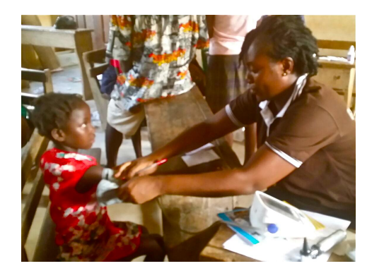
Child receiving care during outreach program / Ghana