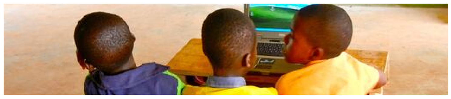
Pathfinder International Academy students / Ghana 2013