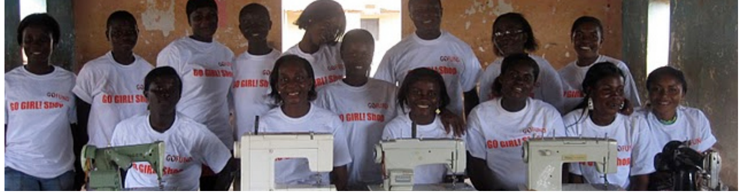
Sew for Sisterhood / Ghana