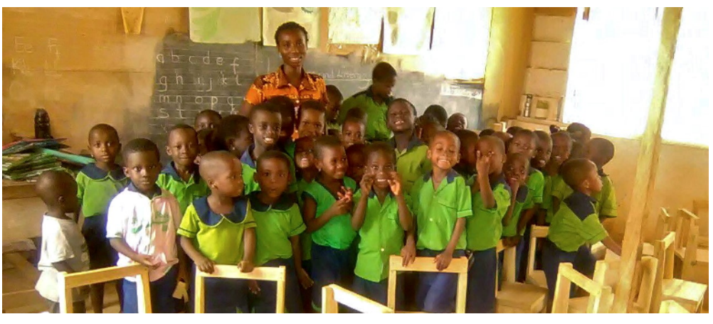
Pathfinder students enjoying a photo opportunity / Ghana

As of September 2018, there were 350 students enrolled, with 19 teachers, one headmaster and four non-teaching staff. The school prepares students for high school qualifying exams, with all June 2017 graduating students passing the exam! We