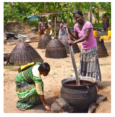
Women microloan entrepreneurs,/ Uganda

Thanks to our collaboration with Lutino Adunu, savings group members have started Income Generating Activities