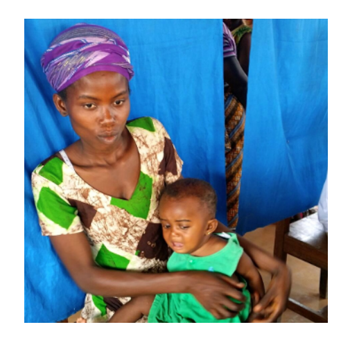
A mother waiting to receive free health insurance for her child / Ghana 2016