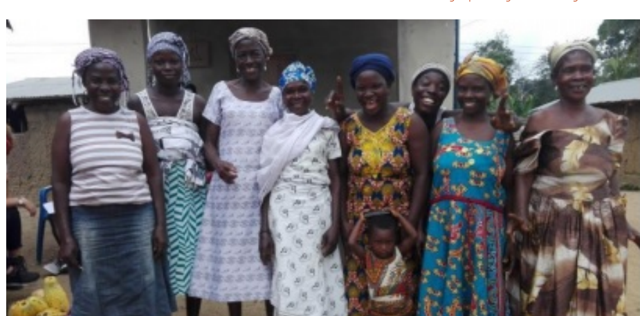
Original microloan program, group members / Ugana