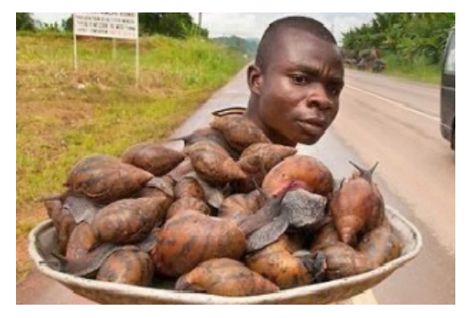
Close-up of the culinary delicacy snails / Ghana

The project was intended to introduce sustainable