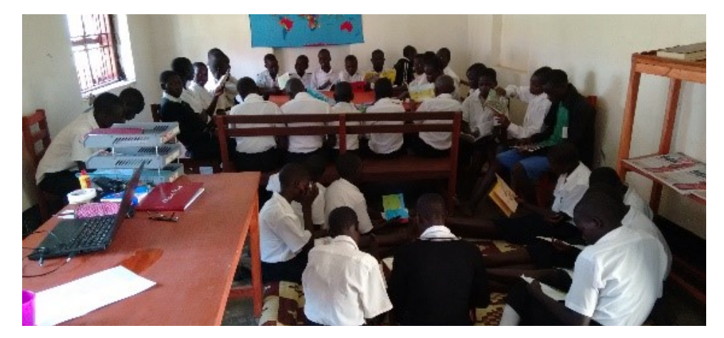
Lutino Adunu Community Library / Uganda