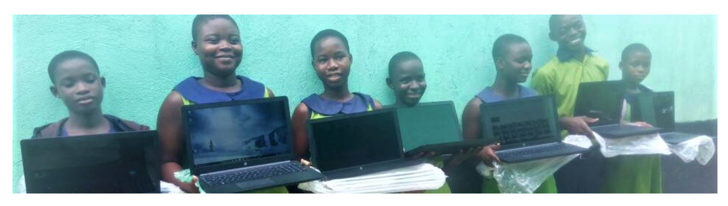
Pathfinder students with new laptops / Ghana 2017