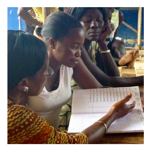
Women's Literacy Project / Uganda