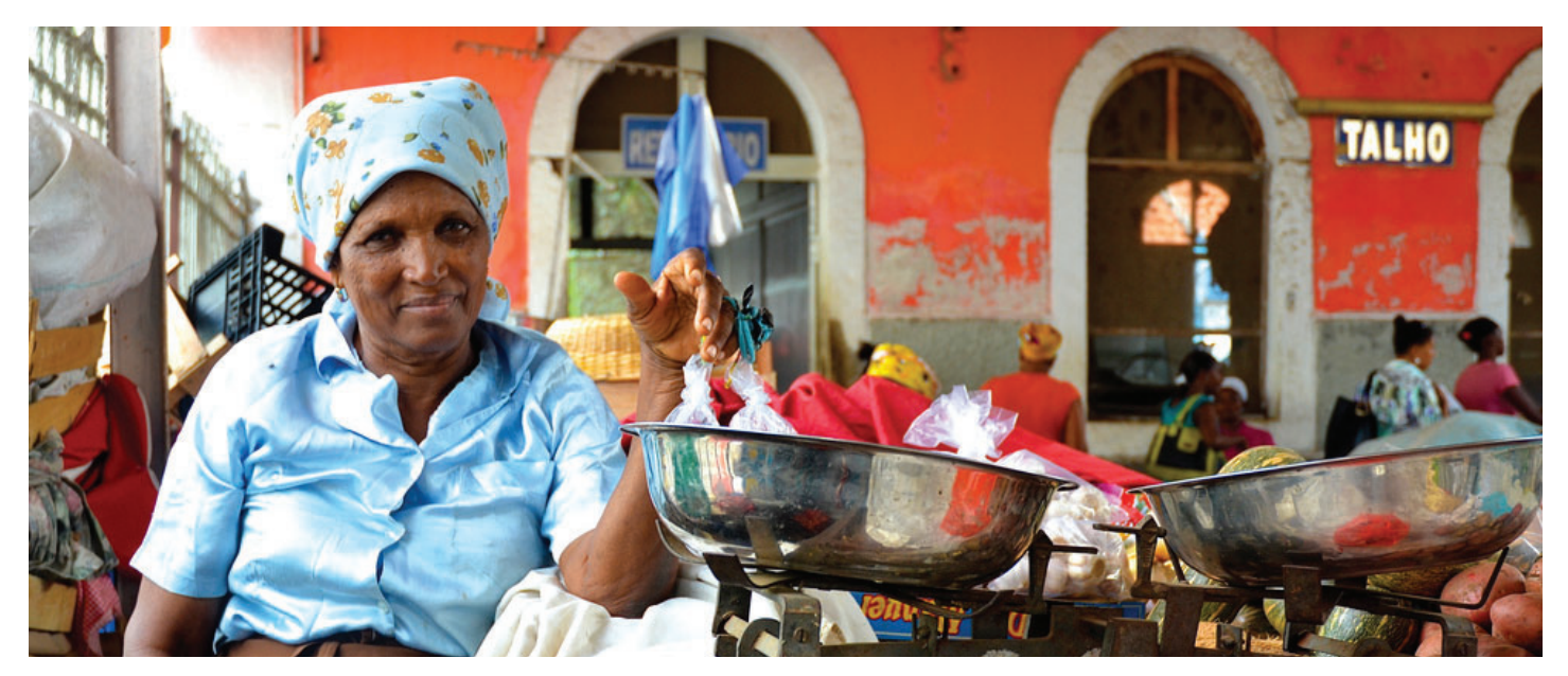
HISTORY, CULTURE & NIGHT LIFE IN Santiago