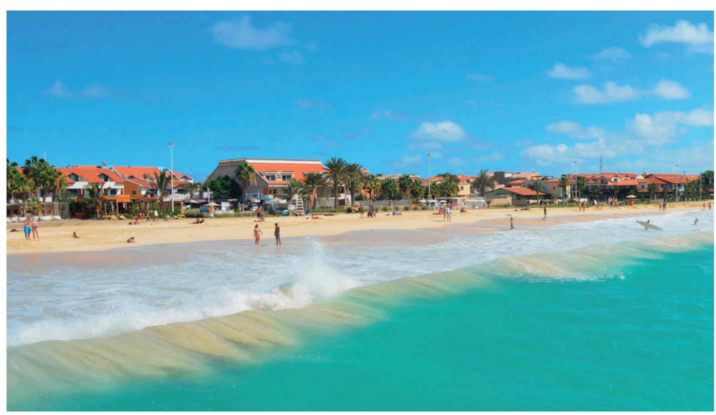
RELAXATION & FUN IN

Mon, Nov 13 - Fly 45 minutes north to Sal Island... After settling into your luxurious room on the flawless white sand beach strip of Santa Maria, take a half day tour of the island including a visit the small city of Espargos, the old salt mine etched into a volcanic crater to exfoliate in its mineral-rich mud, and cleanse with a dip in its healing waters.