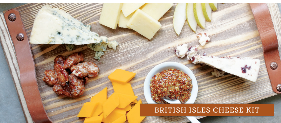
BRITISH ISLES CHEESE KIT