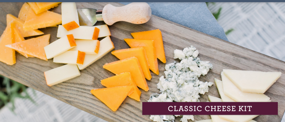
CLASSIC CHEESE KIT