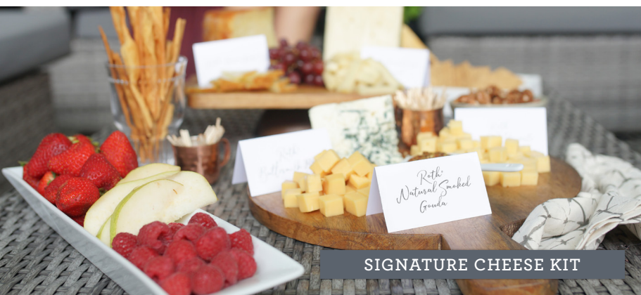
SIGNATURE CHEESE KIT