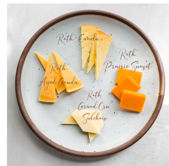
Plate cheeses from mildest to strongest in a clockwise fashion, beginning with Roth® Prairie Sunset® and ending with Roth® Grand Cru® Surchoix.