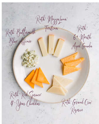
Plate cheeses from mildest to strongest in a clockwise fashion, beginning with Roth® MezzaLuna® Fontina and ending with Roth® Buttermilk Blue®.