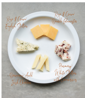
Plate cheeses from mildest to strongest in a clockwise fashion, beginning with Rose & Crown® Double Gloucester and ending with Rose & Crown® Stilton.