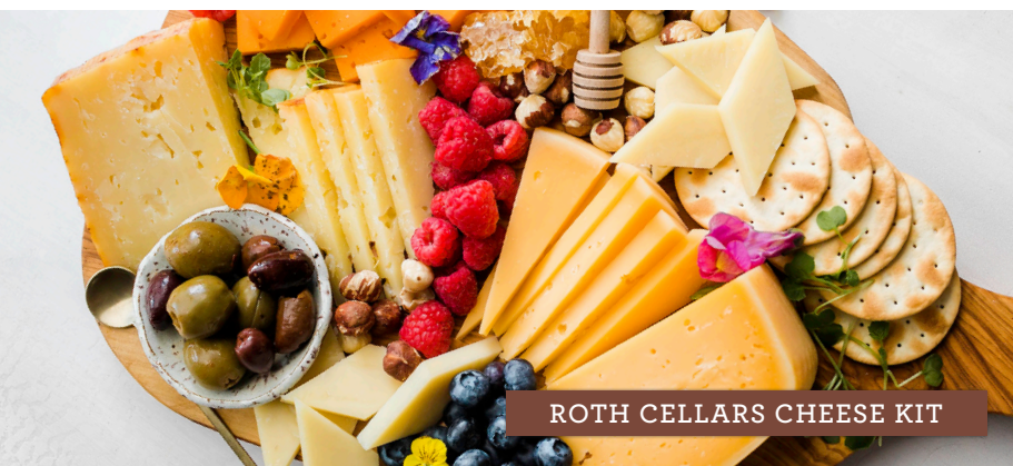
ROTH CELLARS CHEESE KIT