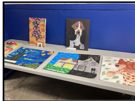
HS Art Display