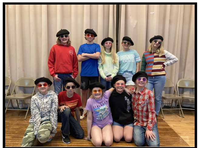
6th Grade Poets