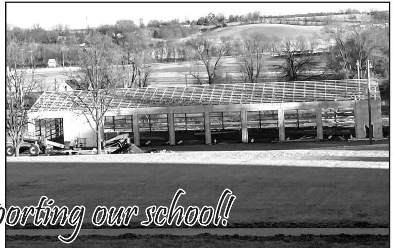
NEW BUS BARN