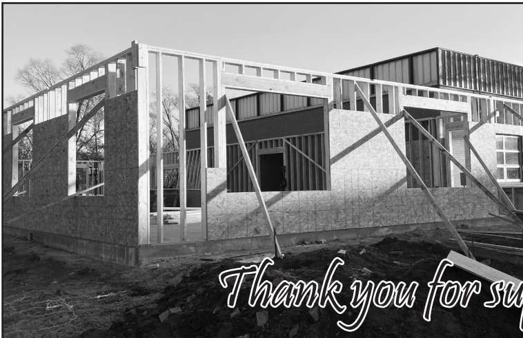
ELEMENTARY NEW ADDITION