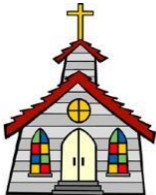
SEMI-ANNUAL CONGREGATIONAL MEETING

Semi-Annual Congregational Meeting will be held June 29th immediately after worship service. This meeting will consist of Committee Reports and election of new board members. All members are strongly encouraged to attend.