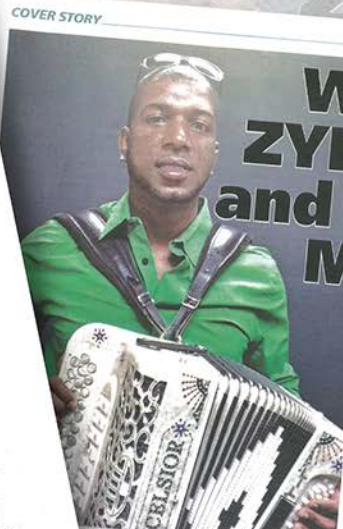
Helping that his performance at the Lafayette Music Festival will help pay zydeco music on...