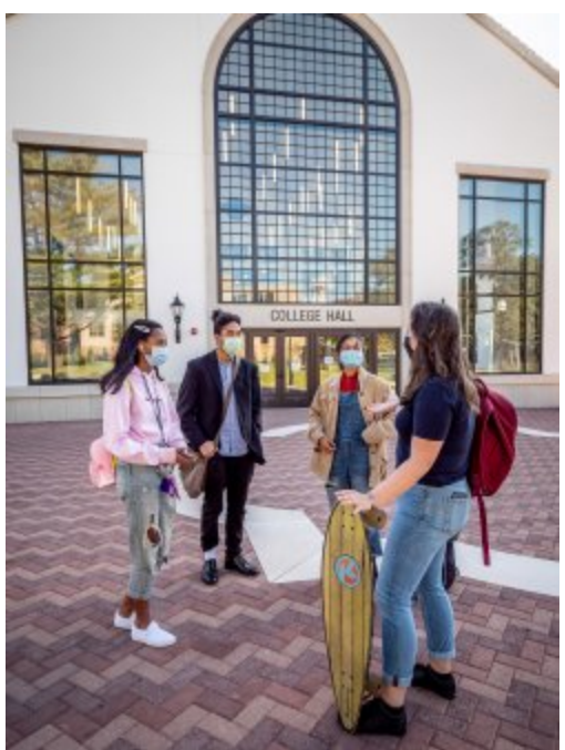
The inside and outside of the College Hall Atrium