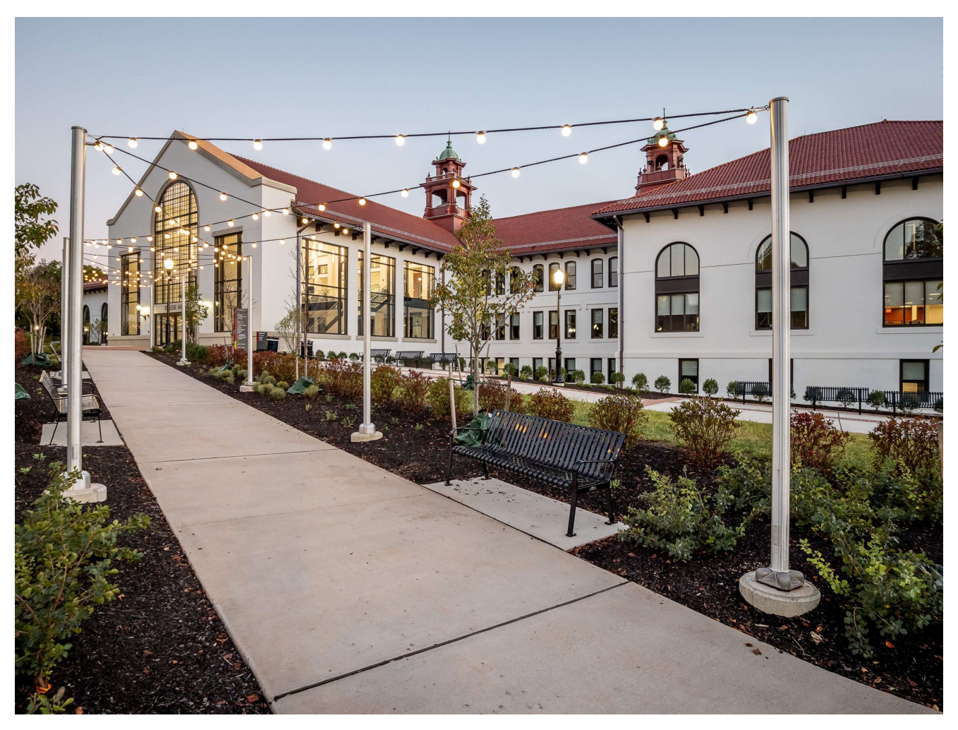
Fairy lights float overhead leading to the north entrance of the newly renovated College Hall.

College Hall – the University's 112-year-old iconic Mission Revival building that housed the entire school when it opened in 1908 - has begun to reopen after three years of renovations to create a modern and convenient one-stop shop for students.