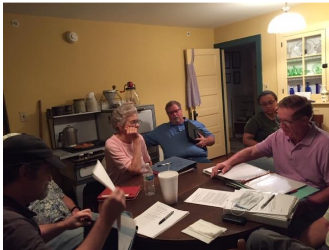
The October Board of Directors – The team is hard at work