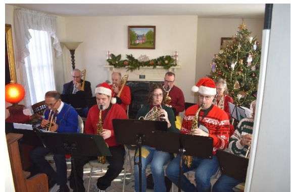
First State Symphonic Band Holiday Ensemble