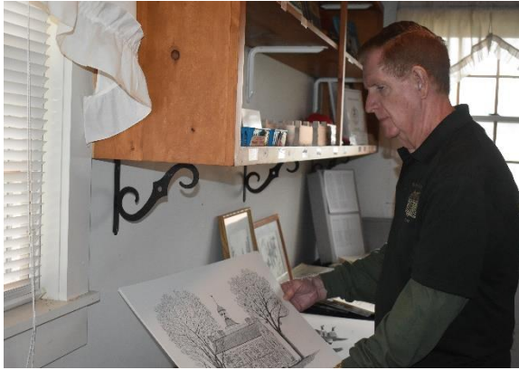
Bob sold items from the store