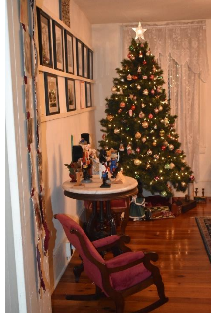
The Caley Christmas ornament collection tree