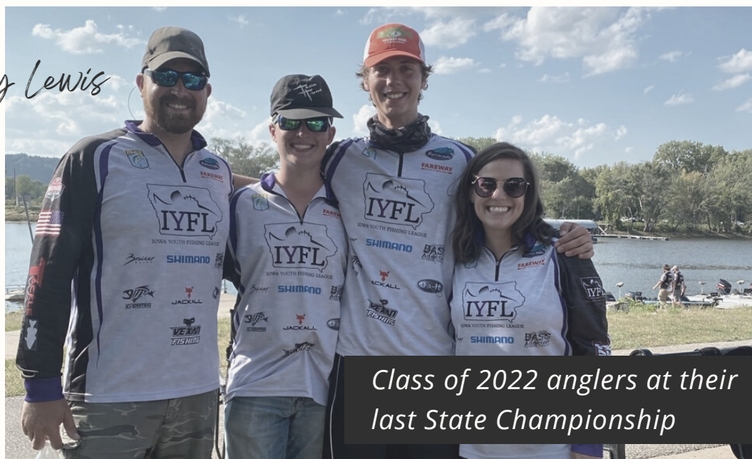
Class of 2022 anglers at their last State Championship