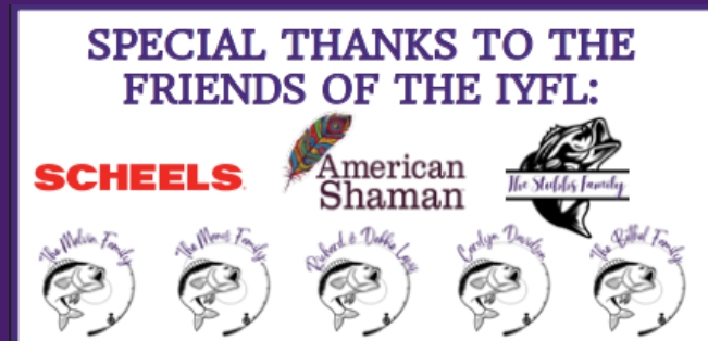
Sample banner from the 2023 season

The Friends of the IYFL Fundraising Campaign is hosted every November and December as part of the Season of Giving. Our organization hosts this campaign to raise funds to go directly to angler programming, scholarships, and to create additional opportunities for our communities for fishing and conservation. Contributions are tax deductible and represented on a banner at events throughout the season.