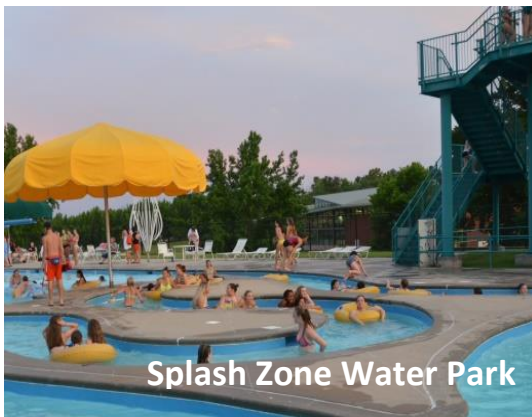
Splash Zone Water Park

AND an all you can eat hot breakfast each morning in the Residential Life Cafeteria or the Super 8 Lobby.