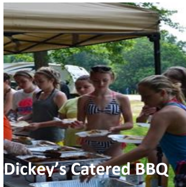
Dickey's Catered BBQ