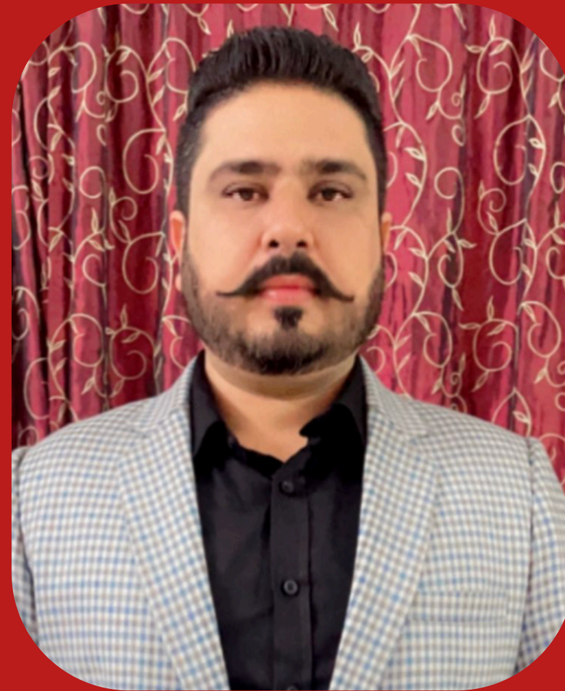
Johnny Gill Afterhours Dispatch