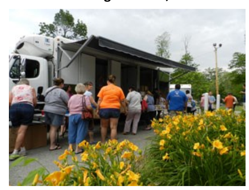
First Wednesday of Every Other Month 4:00—6:00 p.m.

Stilesville Christian Church 8425 Morgan Street, Stilesville