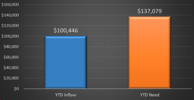
BUMC YTD Inflow vs Need

Weekly Attendance: 9/1: 41 9/8: 39 9/15: 46 9/22: 42 9/29: 44