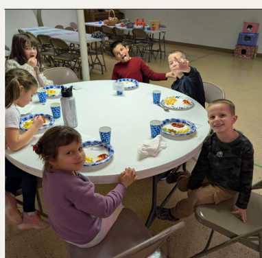
Nuggets and mac n cheese for dinner