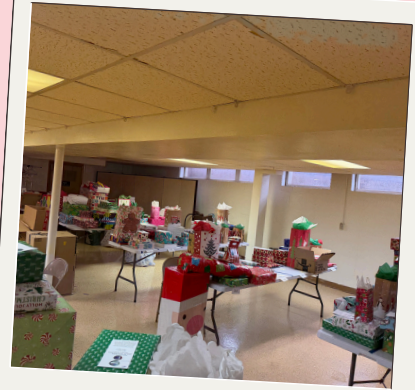
Presents for the 2025 Giving Tree