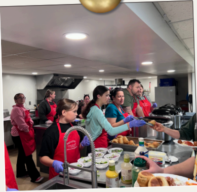
Dinner on Broadway