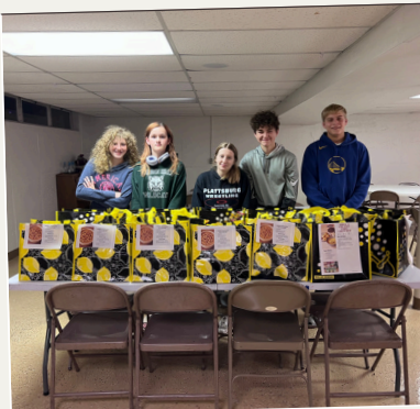
Youth Group making No Hunger November meals