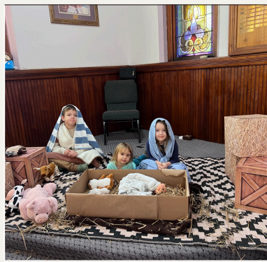
Sunday School Nativity Play