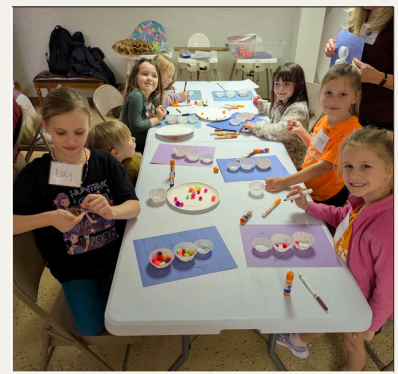
Parents' Night Out Crafts