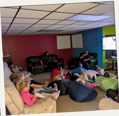
PNO movie time!