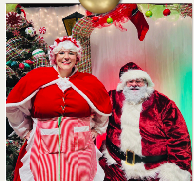
Mr. and Mrs. Claus at Forever Christmas