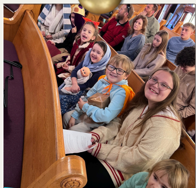
Nativity Play preparation