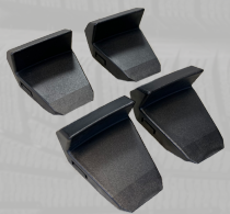
Plastic Rim Clamp Covers (Set of 4)