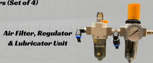
Air Filter, Regulator & Lubricator Unit