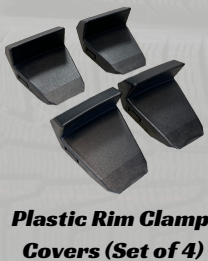
Plastic Rim Clamp Covers (Set of 4)