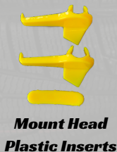
Mount Head Plastic Inserts