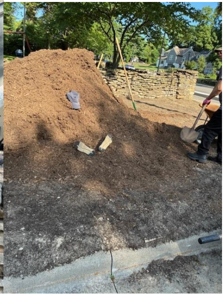
Photos from the Gardens and Architecture Tour