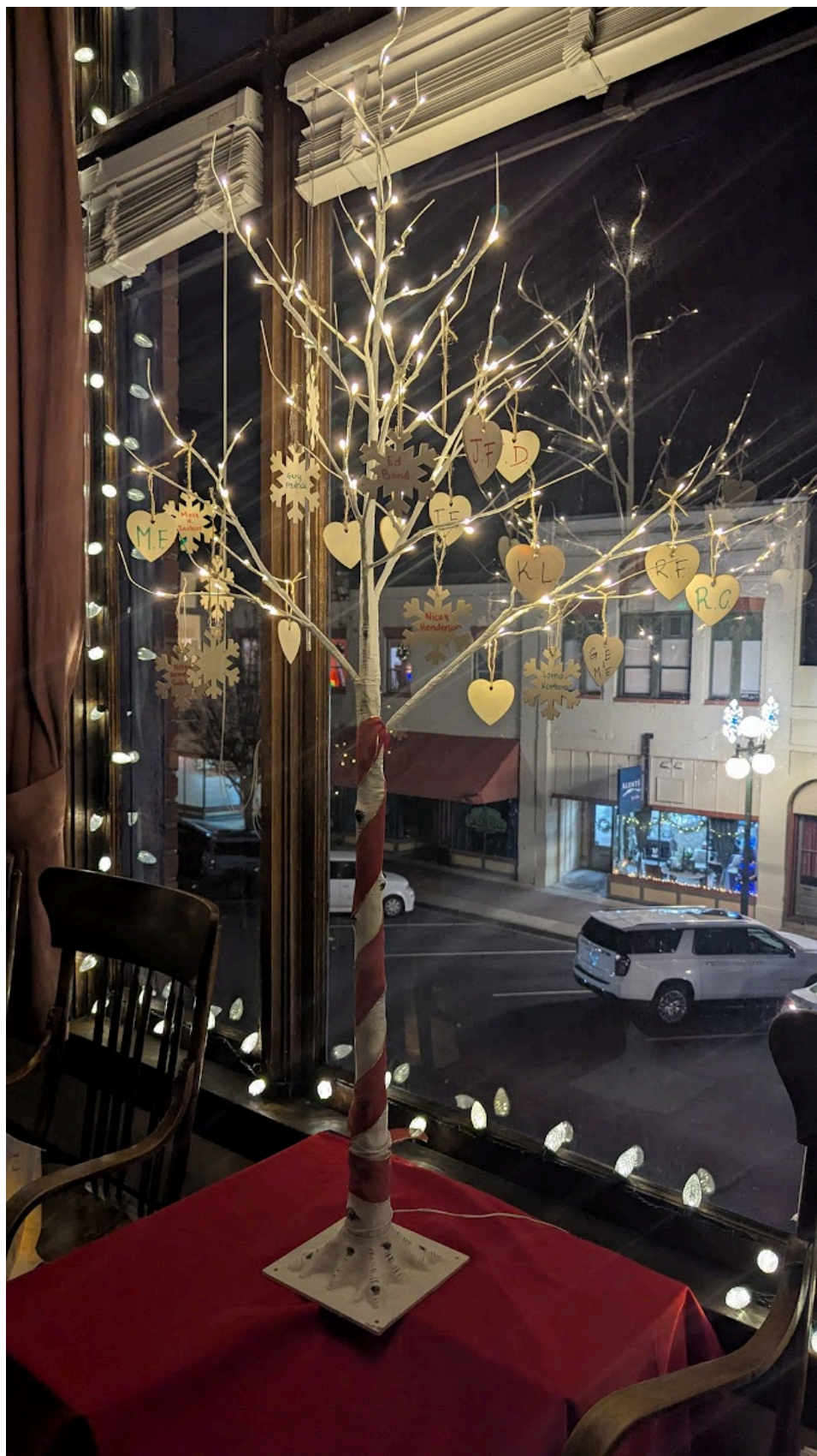
THRIVE Youth Mentoring