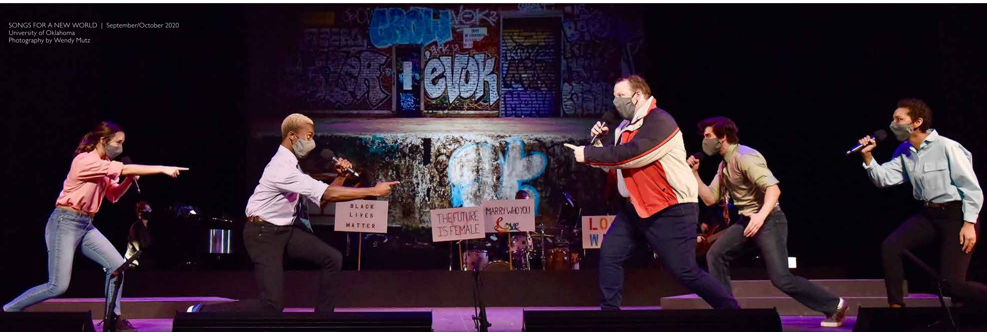
SONGS FOR A NEW WORLD | September/October 2020 University of Oklahoma

As I began to research musical theatre production options during the pandemic, I conducted a survey of forty university and college musical theatre programs throughout the United States to ascertain rehearsal and performance procedures, health and safety protocols, delivery of performances (e.g., in person, live stream, scheduled stream), and title selection for the Fall 2020 semester. Twenty-six of the forty schools produced a musical, revue, song cycle, or other show that included music. All productions streamed the performances online; however, two of the shows also performed in front of a live, socially-distanced audience. Nine programs produced a medium- or large-cast musical or operetta, such as Spring Awakening , Spamalot , Chess , and Pirates of Penzance . Nine programs produced an original work that included program- and student-created cabarets, revues, devised work, original