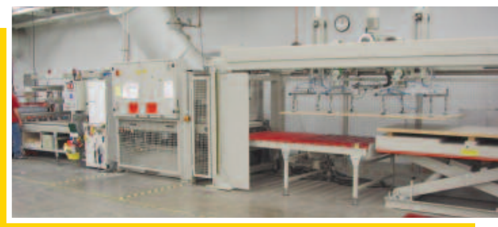
Switching the manufacturing process from a cold press to a Joos throughfeed hot press and stacking line has saved A-dec considerable production time and increased profits.

times that would offer a little more flexibility in terms of when we could lay up material," said Brian Bowman, manufacturing engineer for A-dec.