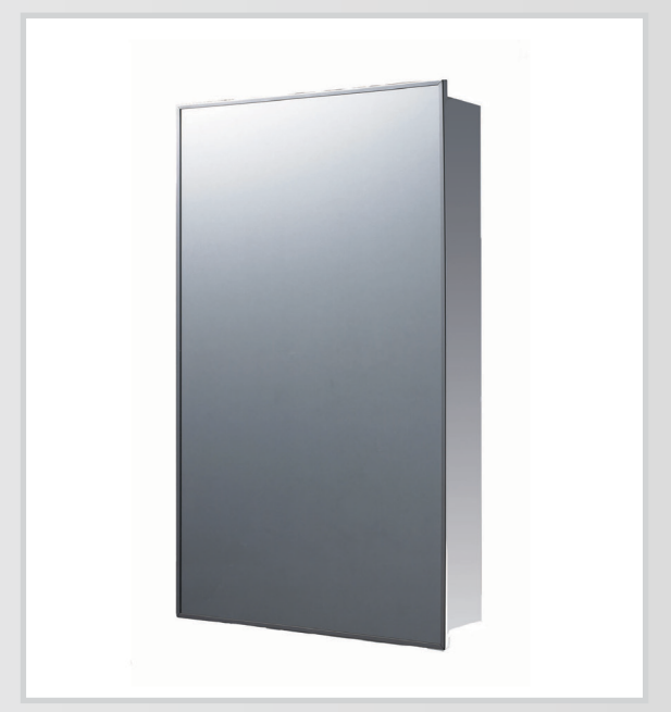
174SS-SM - Single Door

Projection is 1 3/4" for the above models