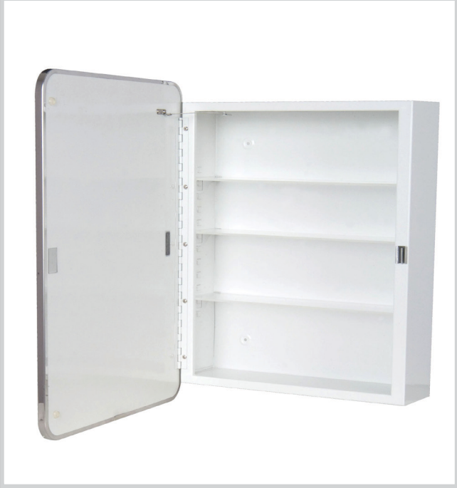
105RSWT-LH - Open