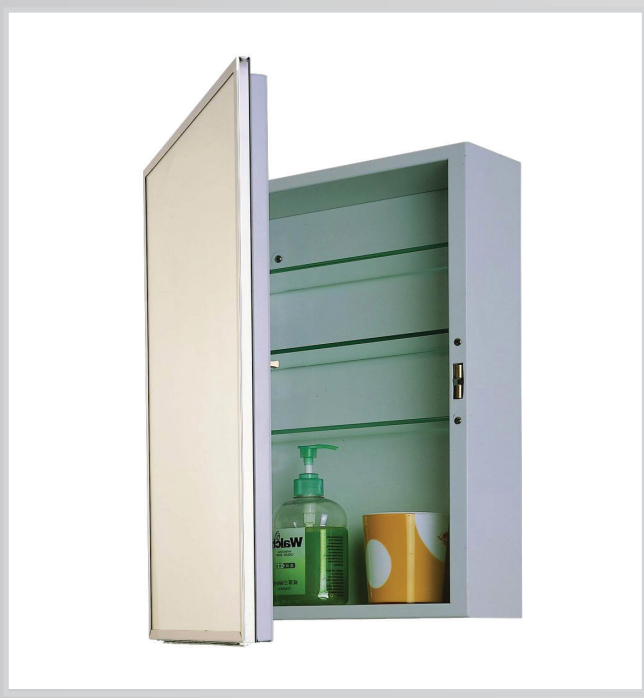
174-HCSM - Open