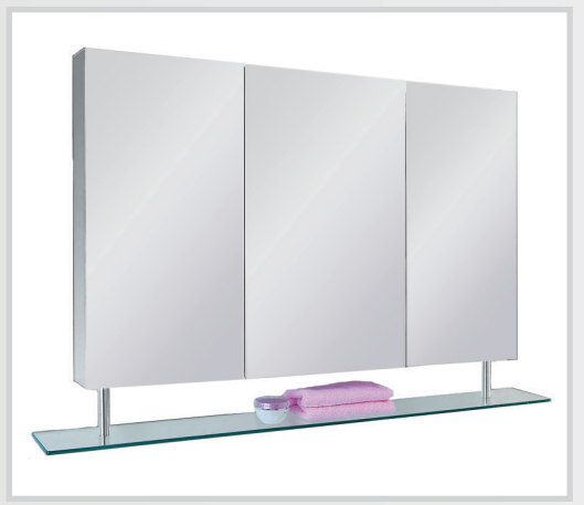
3722-SH with Suspended Shelf