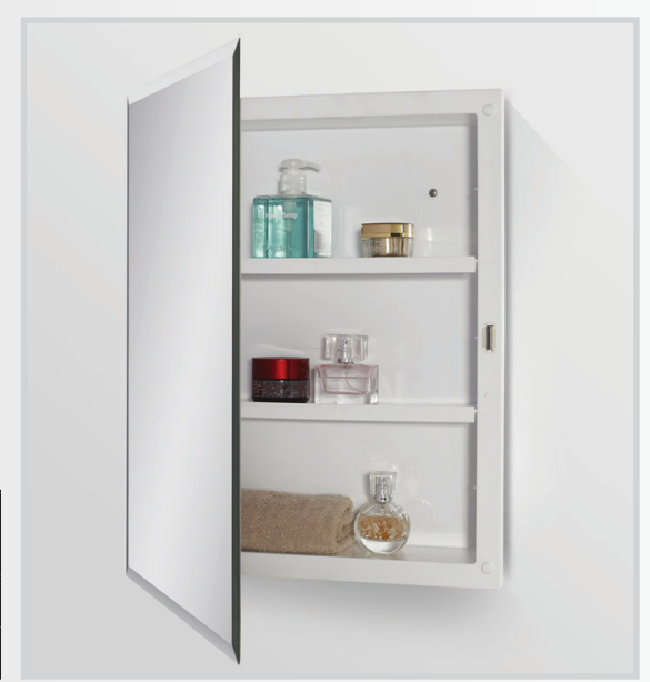
661 BV - Polystyrene