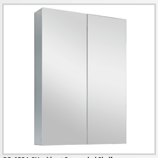
DD-1926-SH without Suspended Shelf