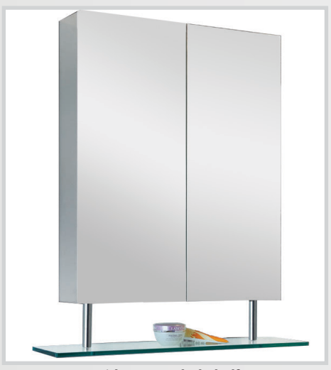
DD-1926-SH with Suspended Shelf

Shelves: Fixed stainless steel shelves. Suspended exterior tempered glass shelf with a polished edge.