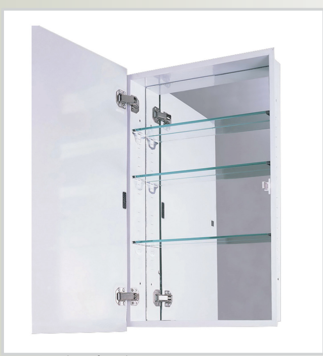
126PE-MI - Mirrored Interior