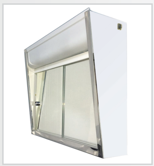
SDL-2419 - Side View