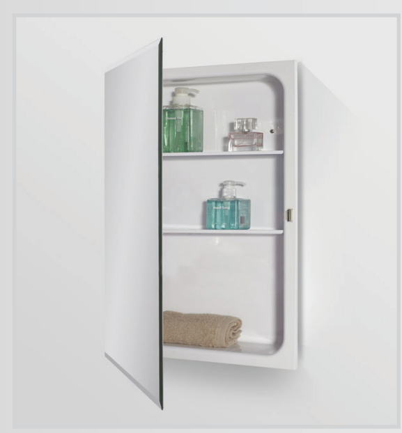
675BV - Deep Drawn