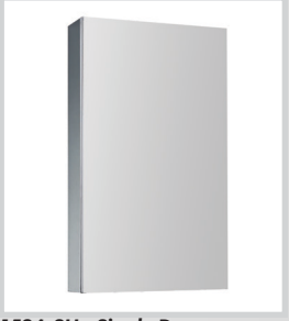
1526-SH - Single Door without Suspended Shelf