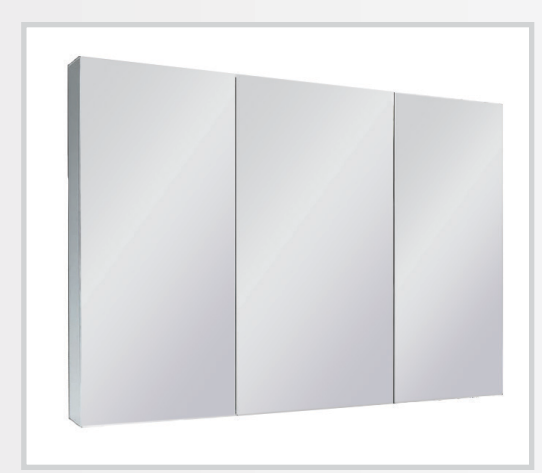
3722-SH without Suspended Shelf