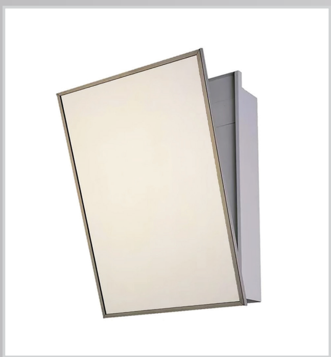
174-HCSM - Mirror Tilted

Mirrors/Doors: 3/16" first quality plate glass framed with bright annealed stainless steel. Doors are mounted on a full length piano hinge and are equipped with a magnetic door catch. Tilt mirror operates on two heavy duty elbow hinges and is secured with two bullet type latches; one to secure the tilted mirror in place and one to hold the door closed. Doors are hinged on the left. Shelves: 1/4" adjustable tempered glass shelves mounted on locking adjustable aluminum shelf clips.