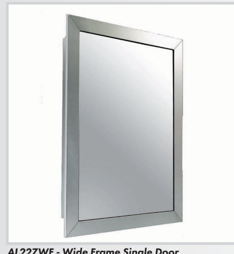
AL227WF - Wide Frame Single Door