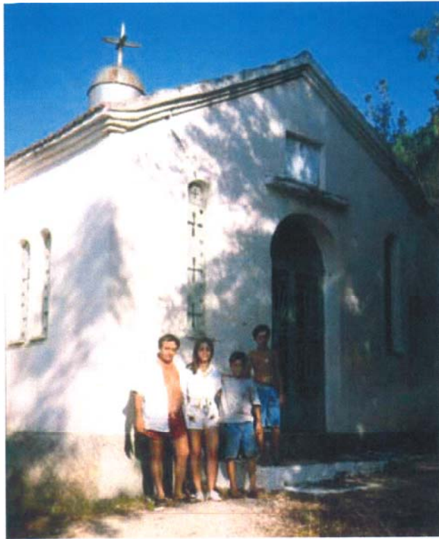
AT OUR FAMILY'S MONASTERY. GREECE 1993. LAST TIME I WAS THERE