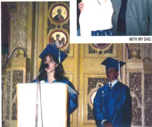
GRADUATION CLASS SPEAKER. 1993

spired me to chase my dreams," she revealed with a laugh. "I knew they got their start straight out of high school, so when I went to college, I thought if they chased their dreams when they were my age, I could too!"