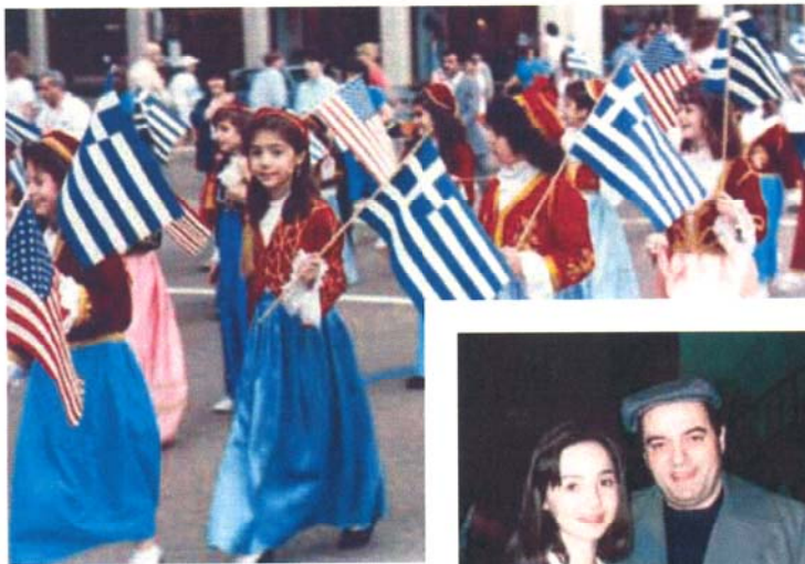
GREEK PARADE. 1987