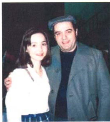
WITH MY DAD. 1992