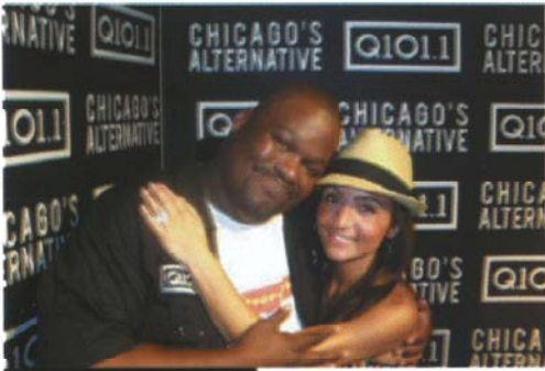
COUNTDOWN CHICAGO 2011