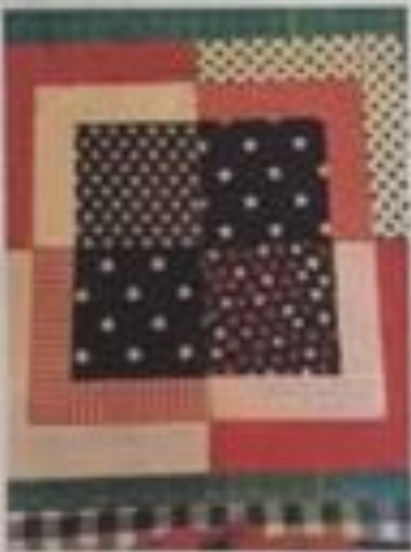
Four block Array