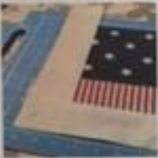
Quarter round stitching