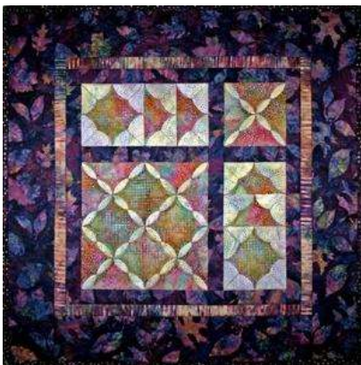
Cathedral Windows Sampler - February