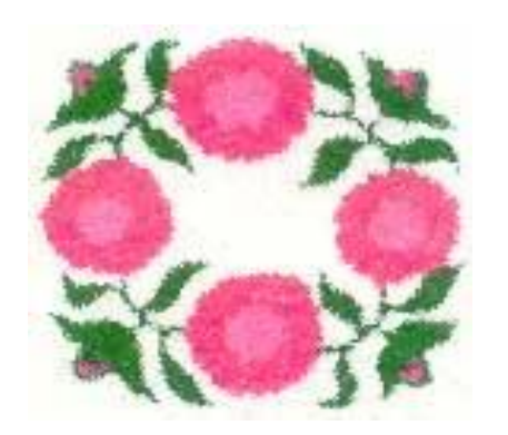
Check out our website: <a href="https://www.scvquiltguild.org">www.scvquiltguild.org</a> WOW! See the newsletter online!

April 19, 2018 at 6:30 PM Business Meeting Newhall Public Library