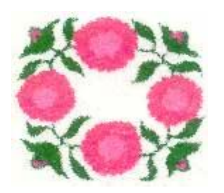
Check out our website: <a href="https://www.scvquiltguild.org">www.scvquiltguild.org</a> WOW! See the newsletter online!

November 15, 2018 at 6:30 PM Business Meeting Newhall Public Library