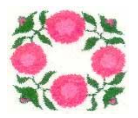
Check out our website: <a href="https://www.scvquiltguild.org">www.scvquiltguild.org</a> WOW! See the newsletter online!

Santa Clarita Valley Quilt Guild P.O. Box 802863 Santa Clarita, CA 91380-2863