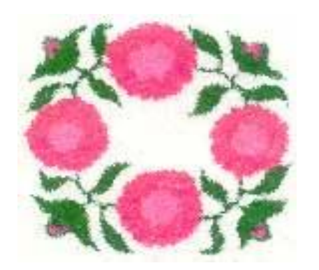
Check out our website: <a href="https://www.scvquiltguild.org">www.scvquiltguild.org</a> WOW! See the newsletter online!

Santa Clarita Valley Quilt Guild P.O. Box 802863 Santa Clarita, CA 91380-2863