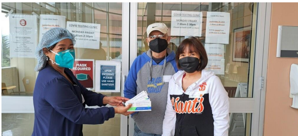
Seton distributed the Boson test kits at its COVID testing site