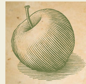
Lonnie grew a 12" apple!