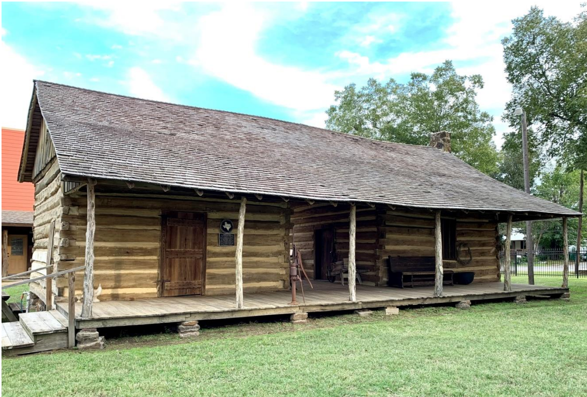
Marker: 01.14.2017 Cabin: 11.18.2022