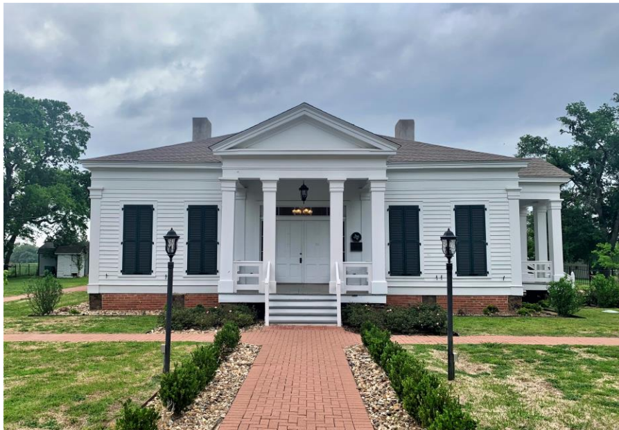
April 4, 2023