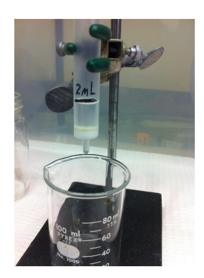
Figure 1 Figure 2 Figure 3