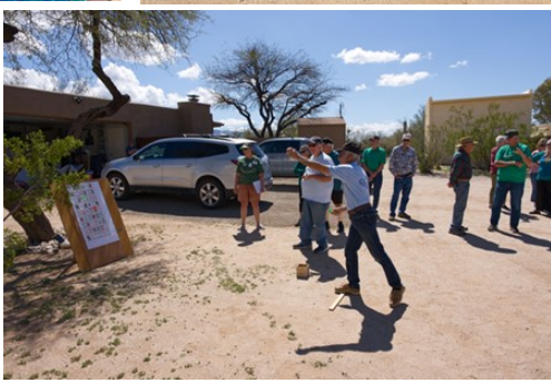
Stop #5 Sabino High School