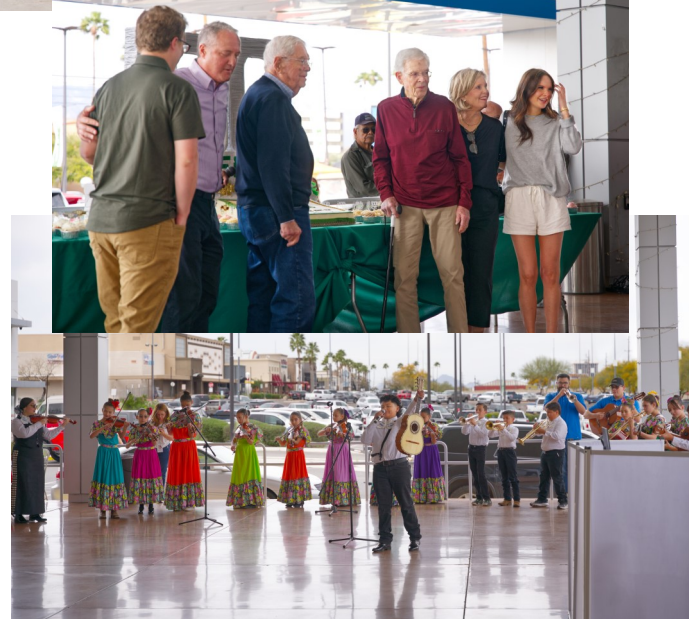
CLUB WEBSITE: http://classicchevycluboftucson.com