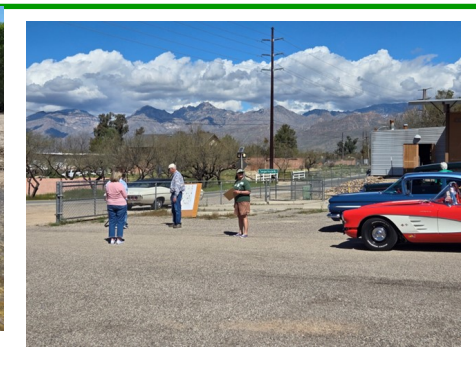
Stop #4 The Hadinger's House