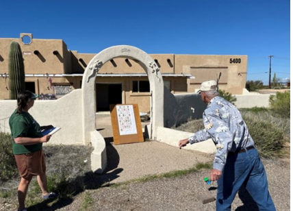
CLUB WEBSITE: http://classicchevycluboftucson.com