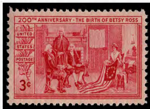
The 3-cent Betsy Ross stamp was issued January 2, 1952.

The story about the creation of the American flag is shrouded in as much legend as fact. Elizabeth Griscom Ross, better known as Betsy, was a seamstress who lived in Philadelphia. According to legend, George Washington employed Betsy to embroider his shirt ruffles. His knowledge of her skill led to a meeting on June 1st when he, accompanied by Colonel George Ross and Robert Morris, presented Betsy with a rough sketch for a flag. Betsy's descendants claim that the three men requested her to create the depicted flag. At Betsy Ross's suggestion, Washington re-drew the design with five-point stars rather than six-point stars.